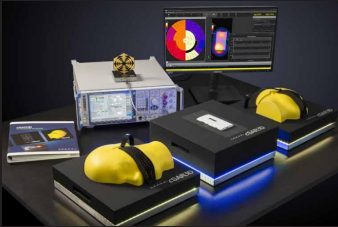
cSAR 3D Fast SAR Measurement