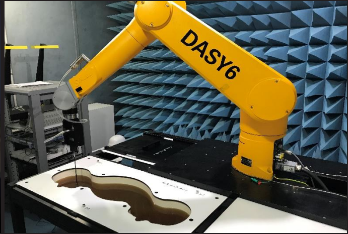
Dosimetric Assessment System