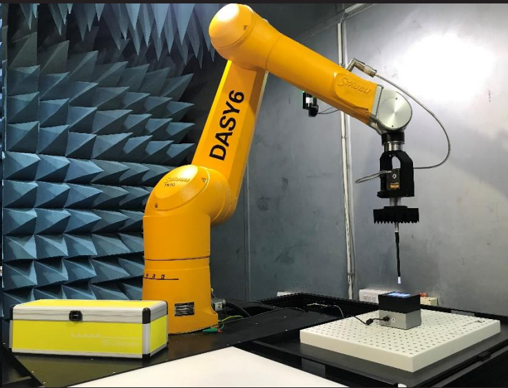
5G Compliance Testing with DASY6